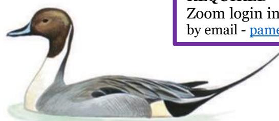
Mud Creek ELC